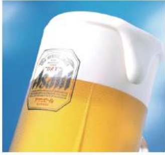
Asahi Draft Beer