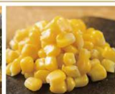
Corn コーン 1.50