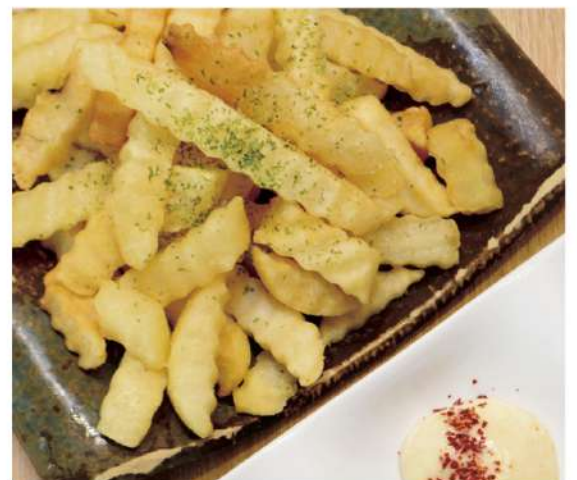
French Fries 7.95