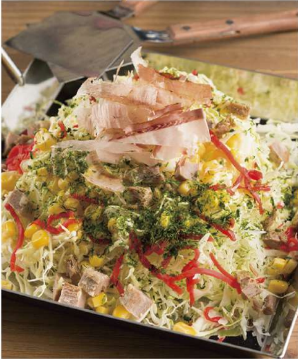
Tokyo "Monja" Salad 8.95

shredded cabbage, corn, nori, soft-boiled egg, red pickled ginger, dried bonito, curry powder, mayonnaise 東京もんじゃサラダ