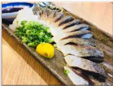
GP Style Grilled Mackerel $16.95 Mackerel, Green onion, Oroshi, Ponzu