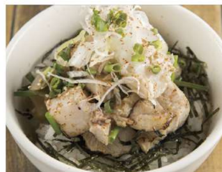
Char siu Bowl (Salt sauce)

pickles, green onion, pepper powder, scallion, sesame, nori,