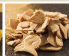
Fried Garlic フライドガーリック 1.50