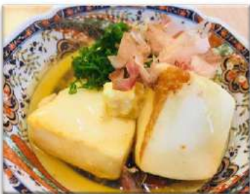
House made Agedashi Tofu $8.75 Tofu, Green onion, Ginger, Bonito, dashi