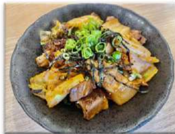
Pork Kimchi Stir-Fried $8.50 Pork belly, Kimchi Green onion, Nori