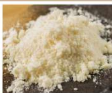
Cheese チーズ 2.00