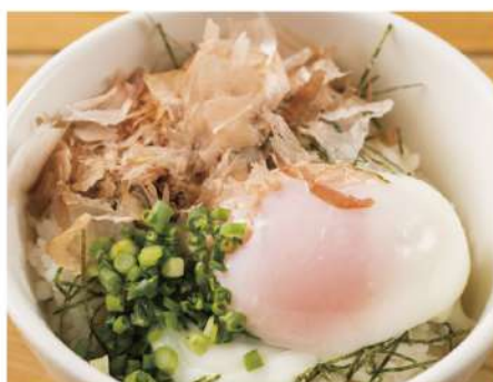
T.K.G "Tamago Kake Gohan"

soft boiled egg, green onion, dried bonito, nori, soy sauce