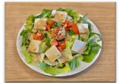
Tan tan Tofu Salad $8.25 Romaine Lettuce, Tomato, Tan tan meat Tofu, Sesame dressing