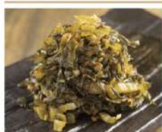
Spicy Takana ピリ辛高菜 2.00

Tsukemen Thick Ramen noodles go well with our Tsukemen soup.