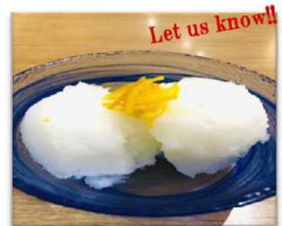
Today's Sherbet $5.50