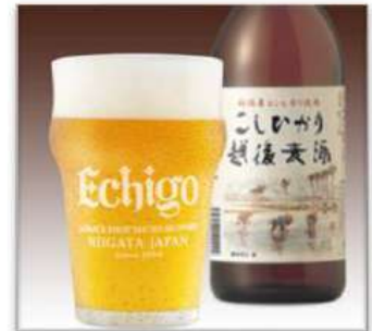
Koshihikari Echigo Beer こしひかり越後ビール $7.95