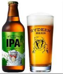
HAKKAISAN RYDEEN BEER IPA 八海山ビール IPA $7.95