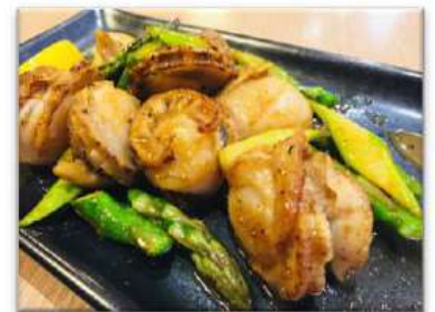
Scallops Garlic butter sauté $8.50 Scallops, Asparagus, Butter, Soy sauce, Garlic, pepper