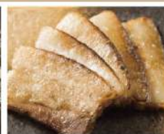
Char siu チャーシュー 3.50