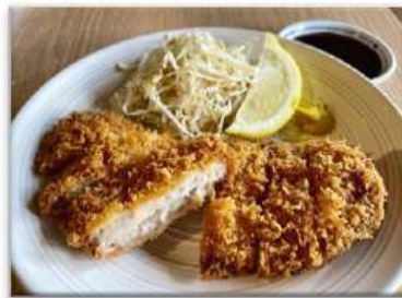
Tonkatsu $10.95 Pork shoulder loin, Cabbage, Mustard, Tonkatsu sauce