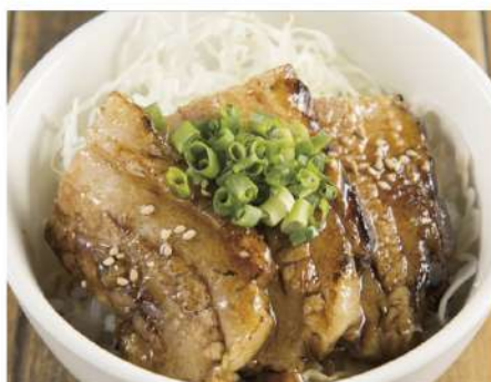
Char siu Bowl (soy sauce)

green onion, sesame, nori, shredded cabbage