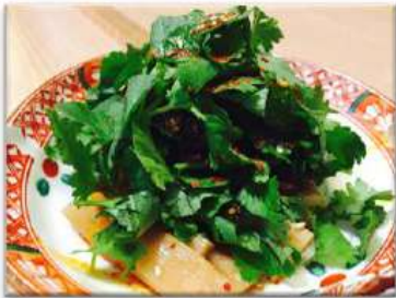
Spicy Cilantro with Bamboo shoots $6.95 Cilantro, Bamboo shoots, Spicy sauce