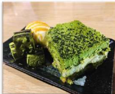
Matcha Tiramisu & Warabimochi $7.95