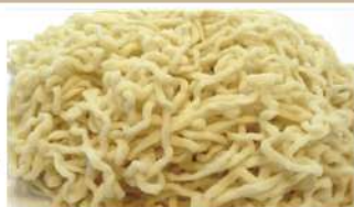
Sub Thick Noodles 平打ち熟成中太麵変更 2.00

If you don't like thin noodles we recommend these thicker (FUTOMEN) noodles for your RAMEN!