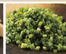
Green Onion 万能ねぎ 1.50