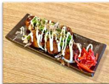
Tako Yaki $8.95 Takoyaki, Bonito, Green onion, Mayonnaise, Red ginger