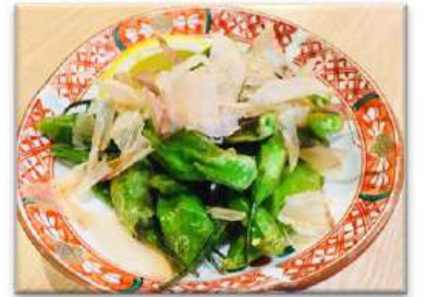
Shishito Peppers $7.50 Deep fry shishito, House made soy sauce