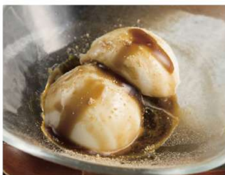
Vanilla ice cream with kinako & kuromitsu (Black honey)

Consuming raw or undercooked food may increase your risk of foodborne illness.