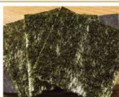
Nori (laver) 焼のり 1.50