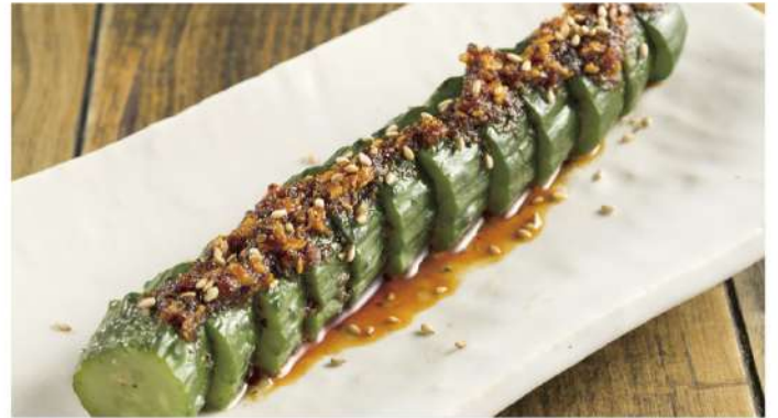
Spicy Cucumber 6.95

shredded cabbage, corn, nori, soft-boiled egg, red pickled ginger, dried bonito, curry powder, mayonnaise 東京もんじゃサラダ