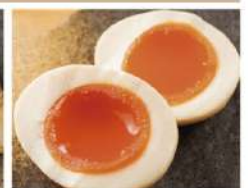
Seasoned egg 味付き卵 2.00