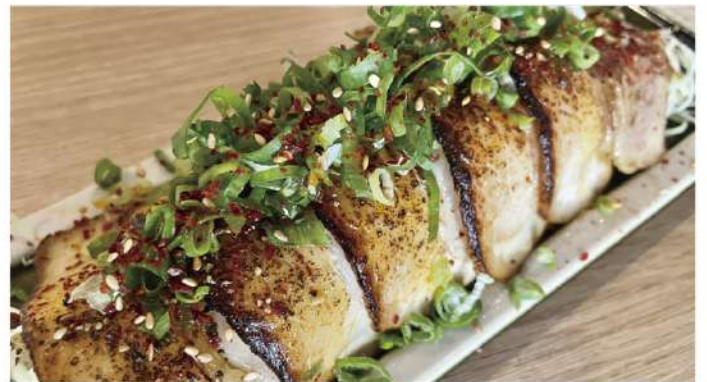
Grilled char siu 7.25

cucumber, chili oil, sesame, fried garlic ピリ辛胡瓜