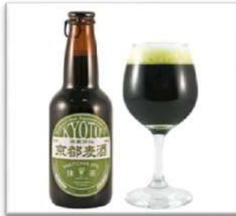
Kyoto Matcha IPA 京都抹茶IPA $7.95