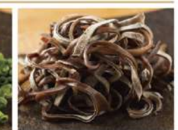
Wood ear mushroom きくらげ 1.50